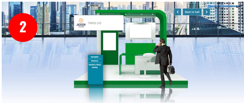
1 logo, 2 content slots , description and option to book a virtual meeting