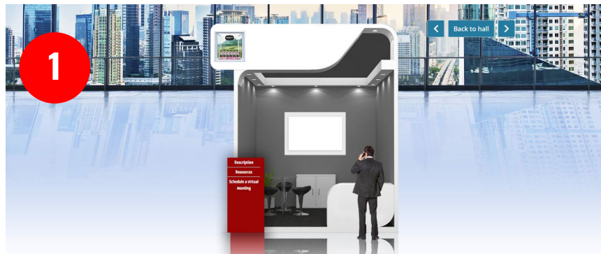
1 logo, 1 content slot , description and option to book a virtual meeting